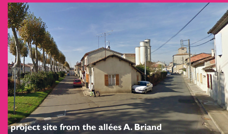
project site from the allées A. Briand