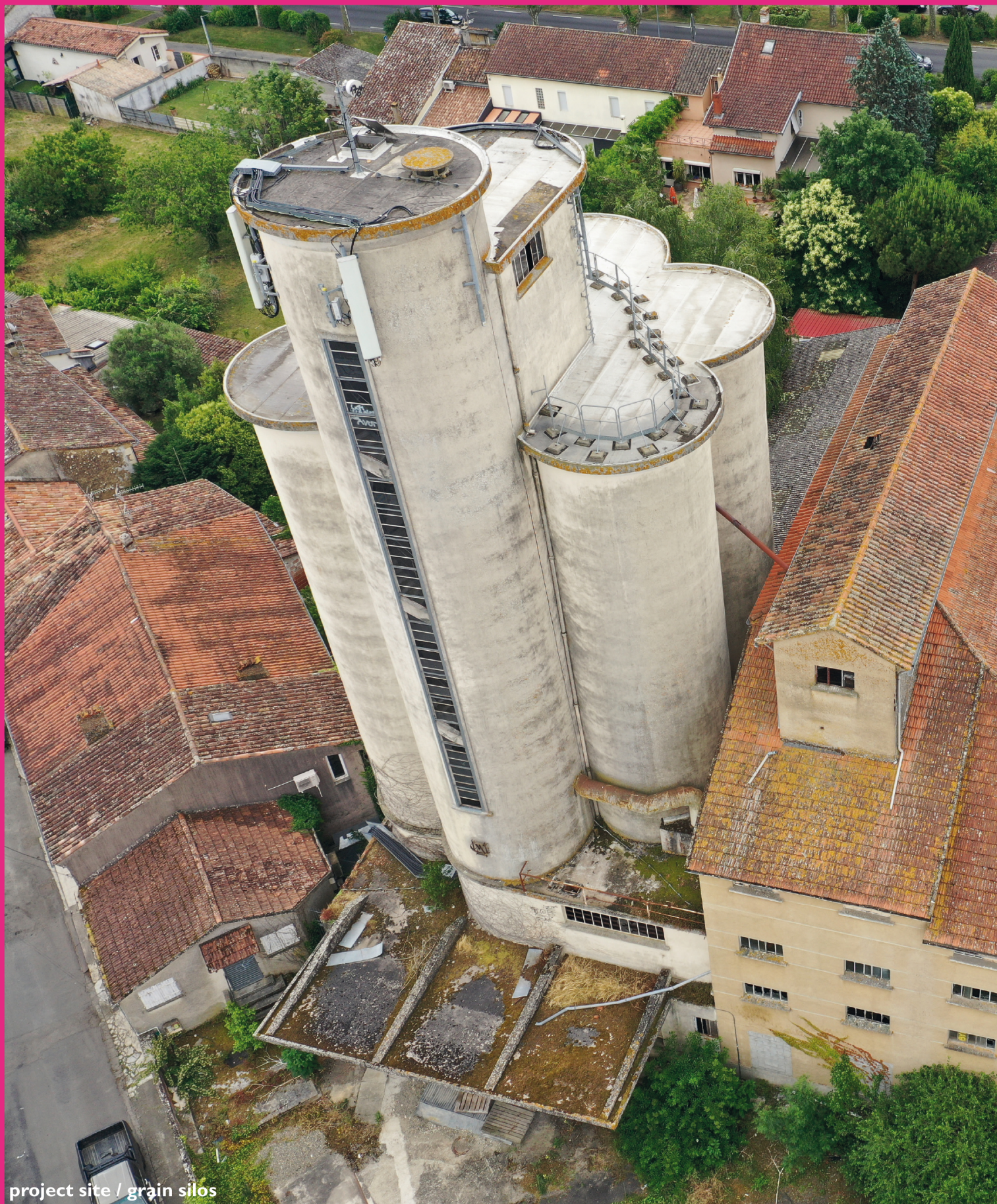
project site / grain silos

Commission after competition: urban and architectural feasibility studies, architectural and urban contract