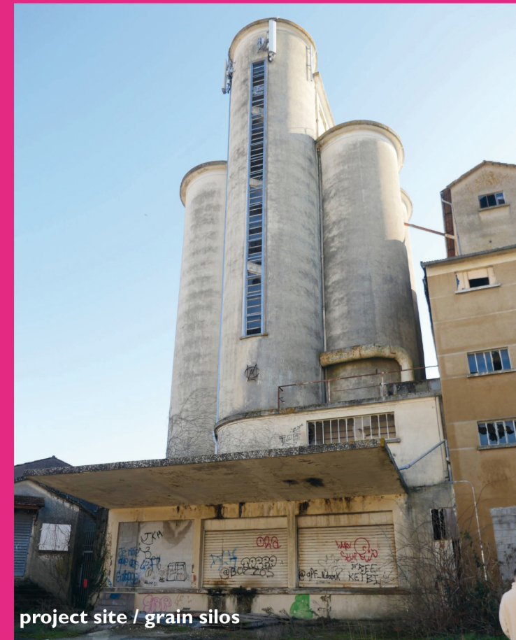
project site / grain silos