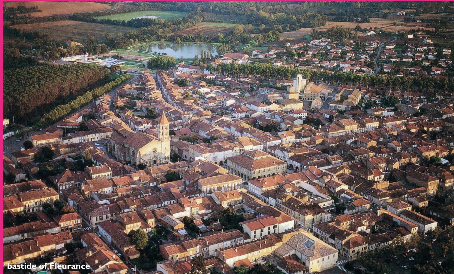
bastide of Fleurance