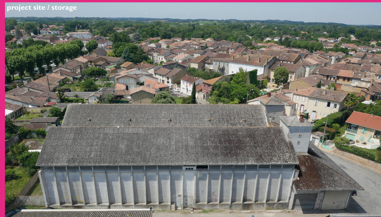
project site / storage