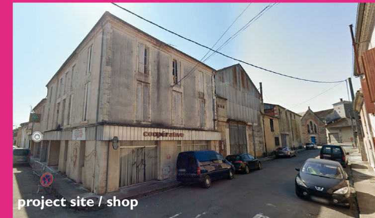
project site / shop