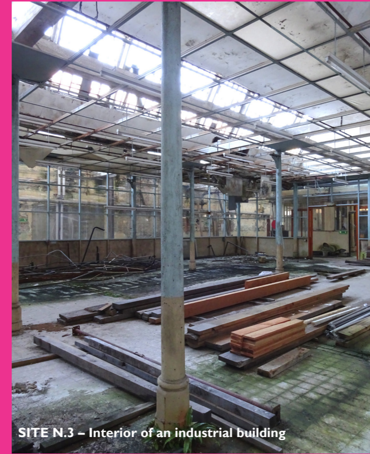
SITE N.3 – Interior of an industrial building