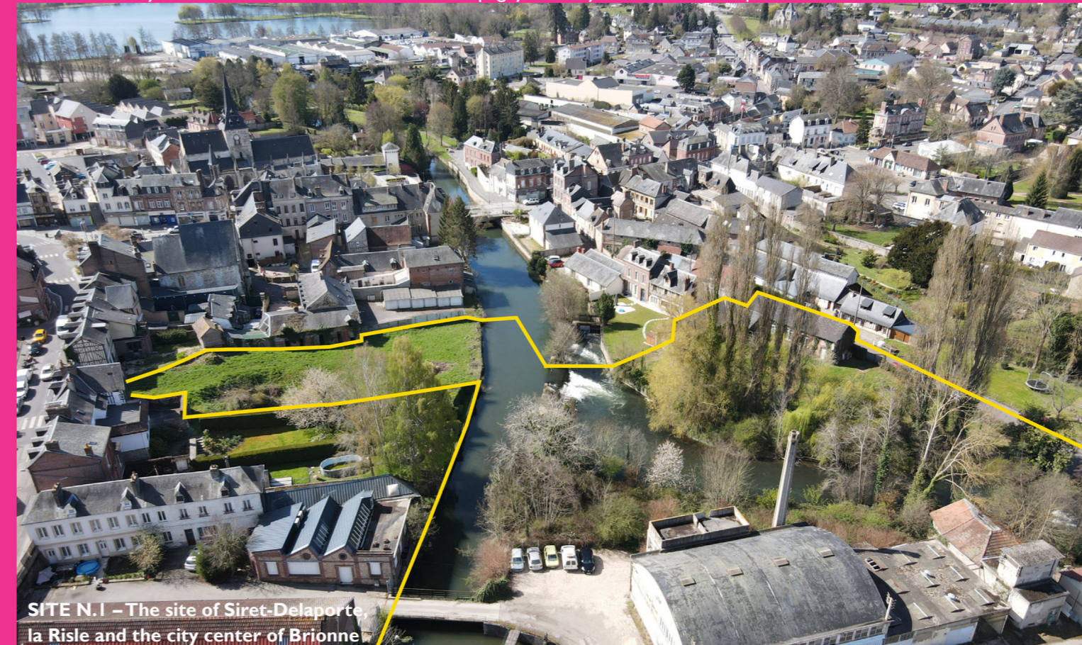
SITE N.1 - The site of Siret-Delaporte, la Risle and the city center of Brionne