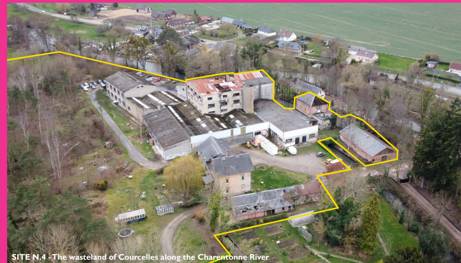
SITE N.4 - The wasteland of Courcelles along the Charentonne River

Within a «circular» approach to land use development, it is also necessary to take into account the specificities of existing facilities. The sites proposed to the competition differ in terms of their size and period of building, the activities they host and the spatial qualities that result from them, their state of conservation, etc. How can we take advantage of what is already there to imagine articulations between the productive city and the living city? How can we take care of the built space, reinterpreting it to preserve the individual and collective memories that have been stratified in these places?