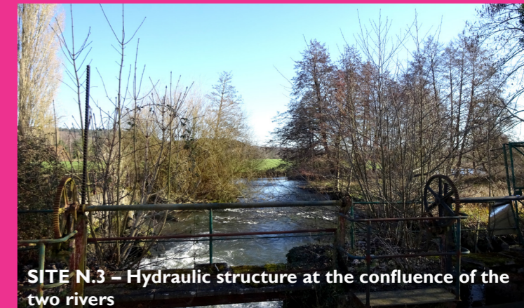
SITE N.3 – Hydraulic structure at the confluence of the two rivers