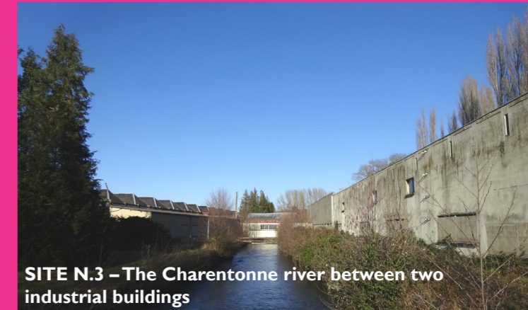
SITE N.3 – The Charentonne river between two industrial buildings