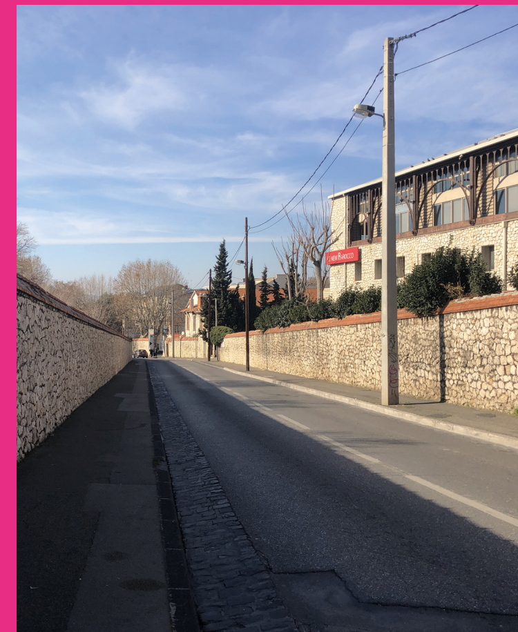
Project site 2