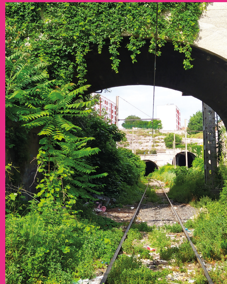
Project site 1