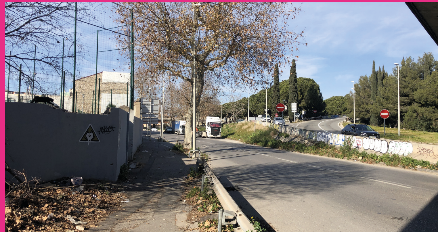
Project site 3

The three project sites were chosen for their potential (nature, position, resources, etc.) to be catalysts in the development of territorial initiatives. They are areas of confrontation, yet they have the potential to be bridges for cross-public action. European is an opportunity to demonstrate the need for «urgent», rapid and efficient interventions on these sites.