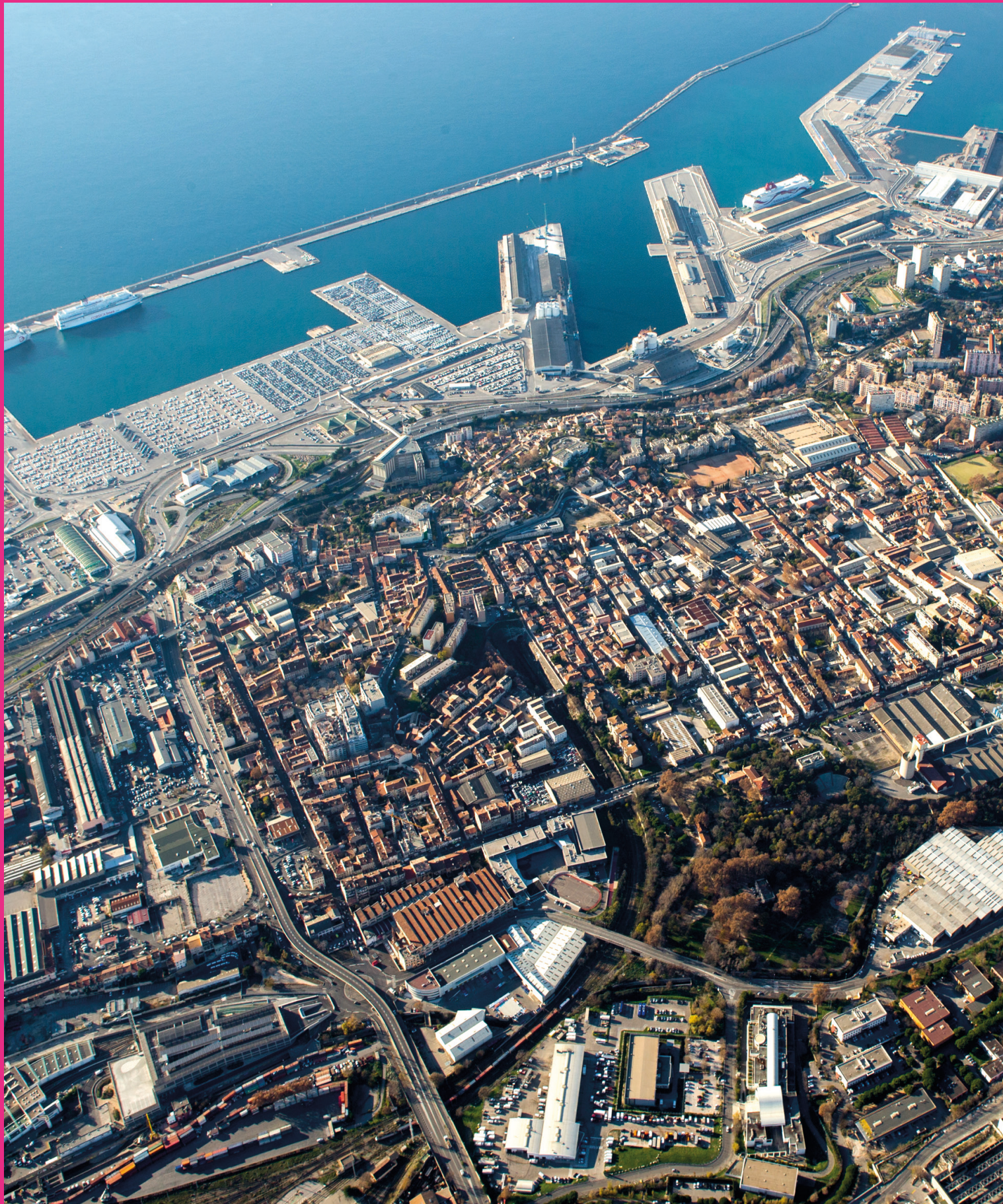
View of the project site |

Competition follow-up : Commissions to further define development strategies • Project site feasibility studies • Project management commissions • Coordinating the start of sites with partners.