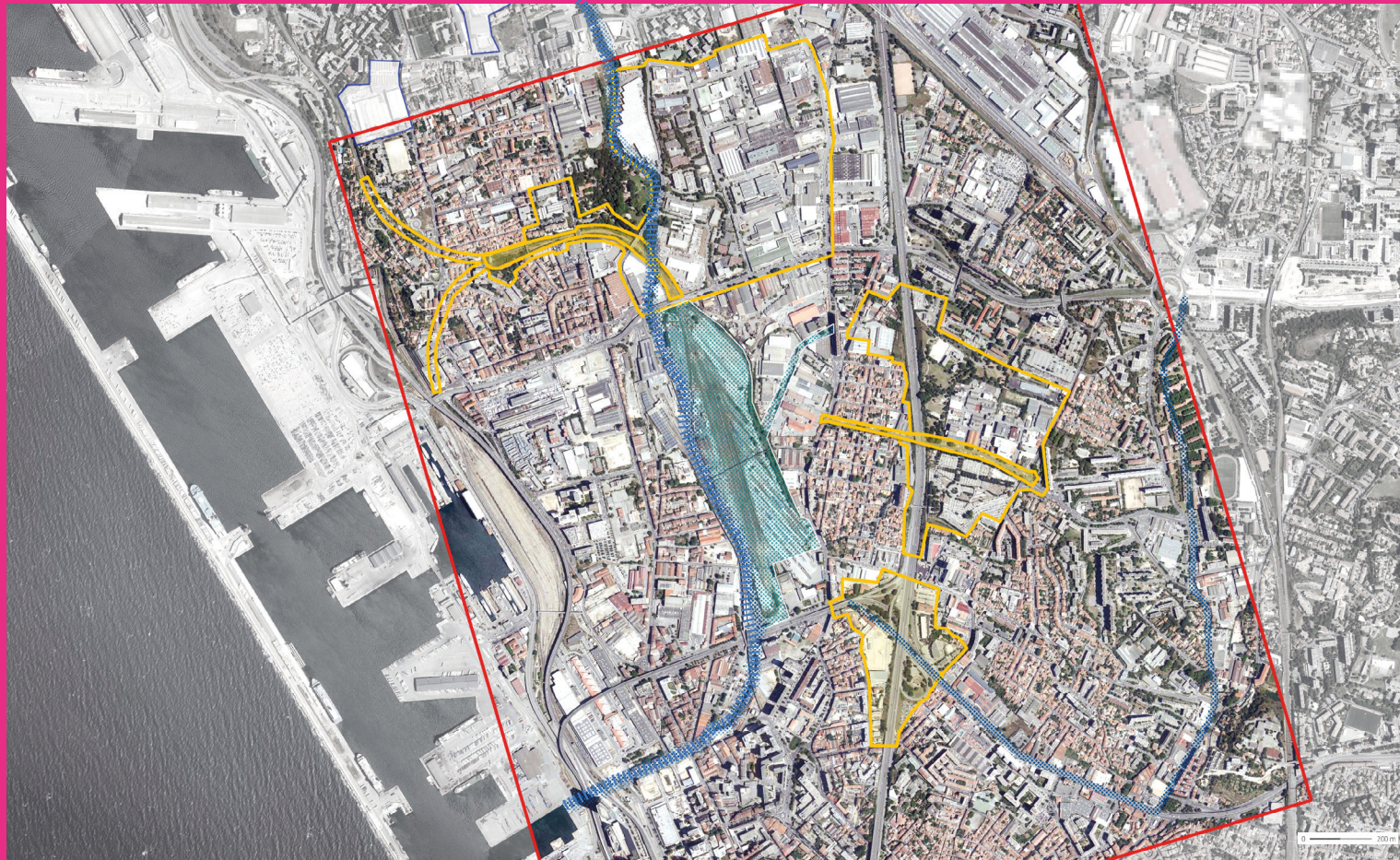
Map showing the study site and project sites