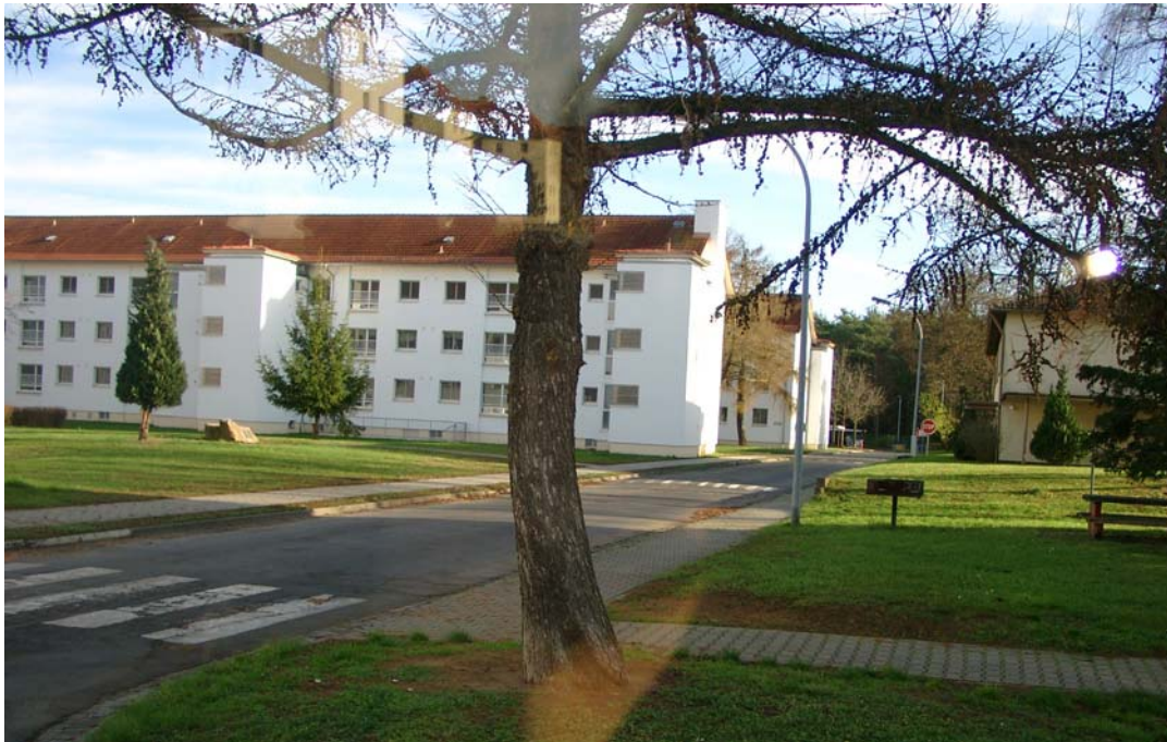
baracks - residential blocks