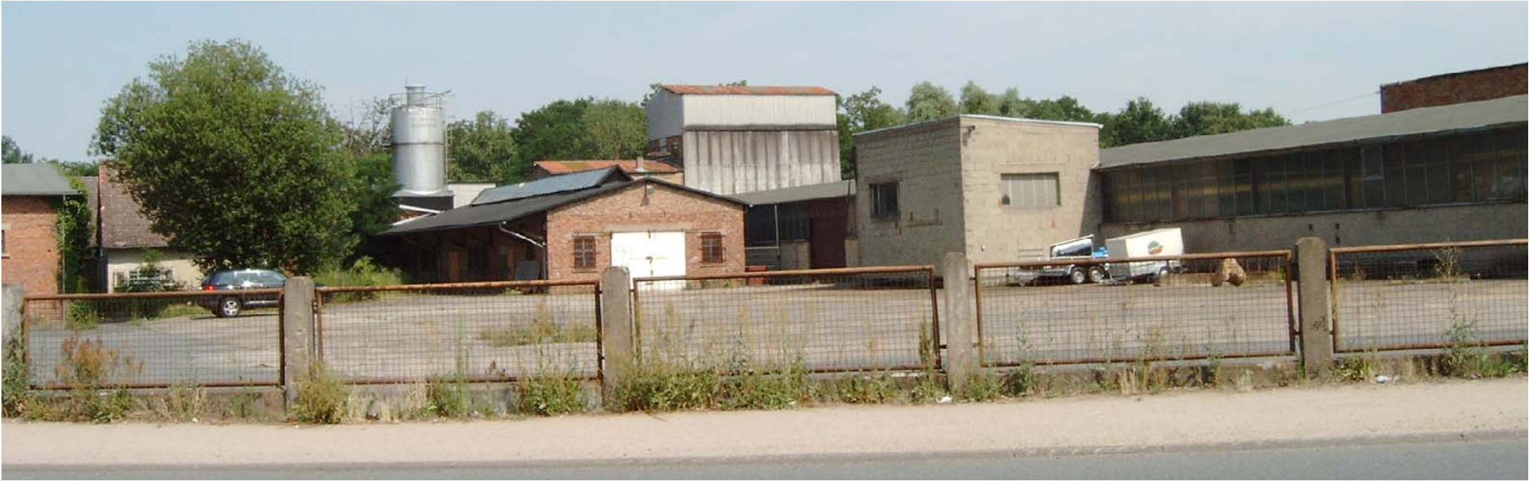
industrial wasteland "former casting factory"