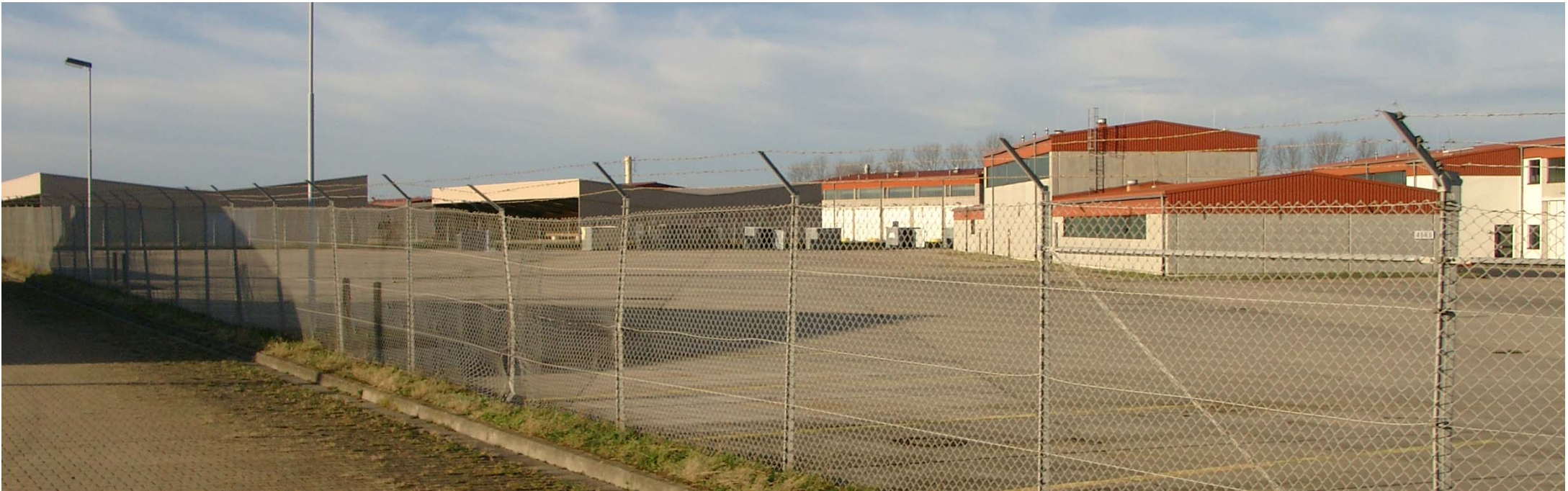
workshop area of the barracks