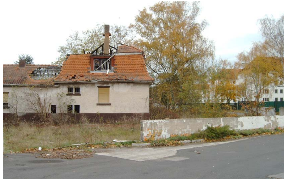
industrial wasteland with residential blocks in the background