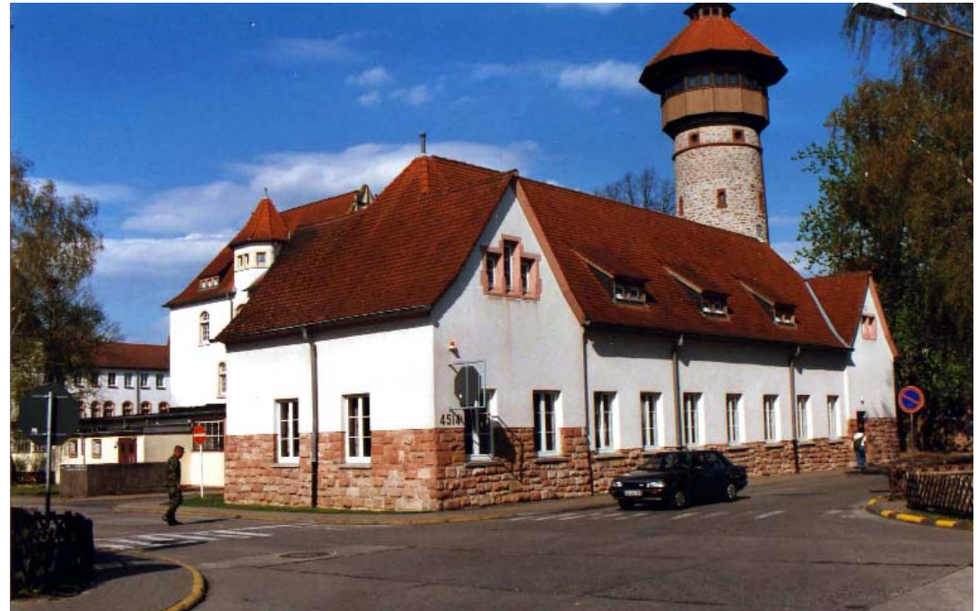
baracks - former library with the old water tower