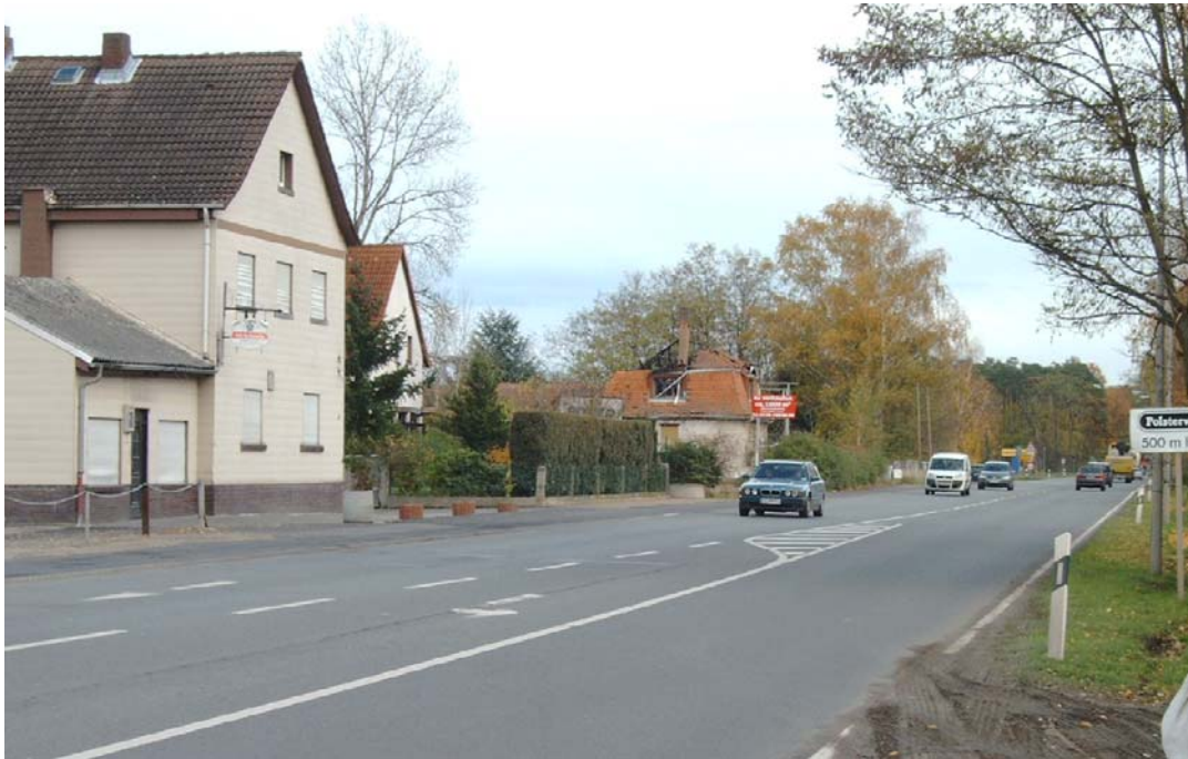
industrial wasteland federal road B26, towards Aschaffenburg