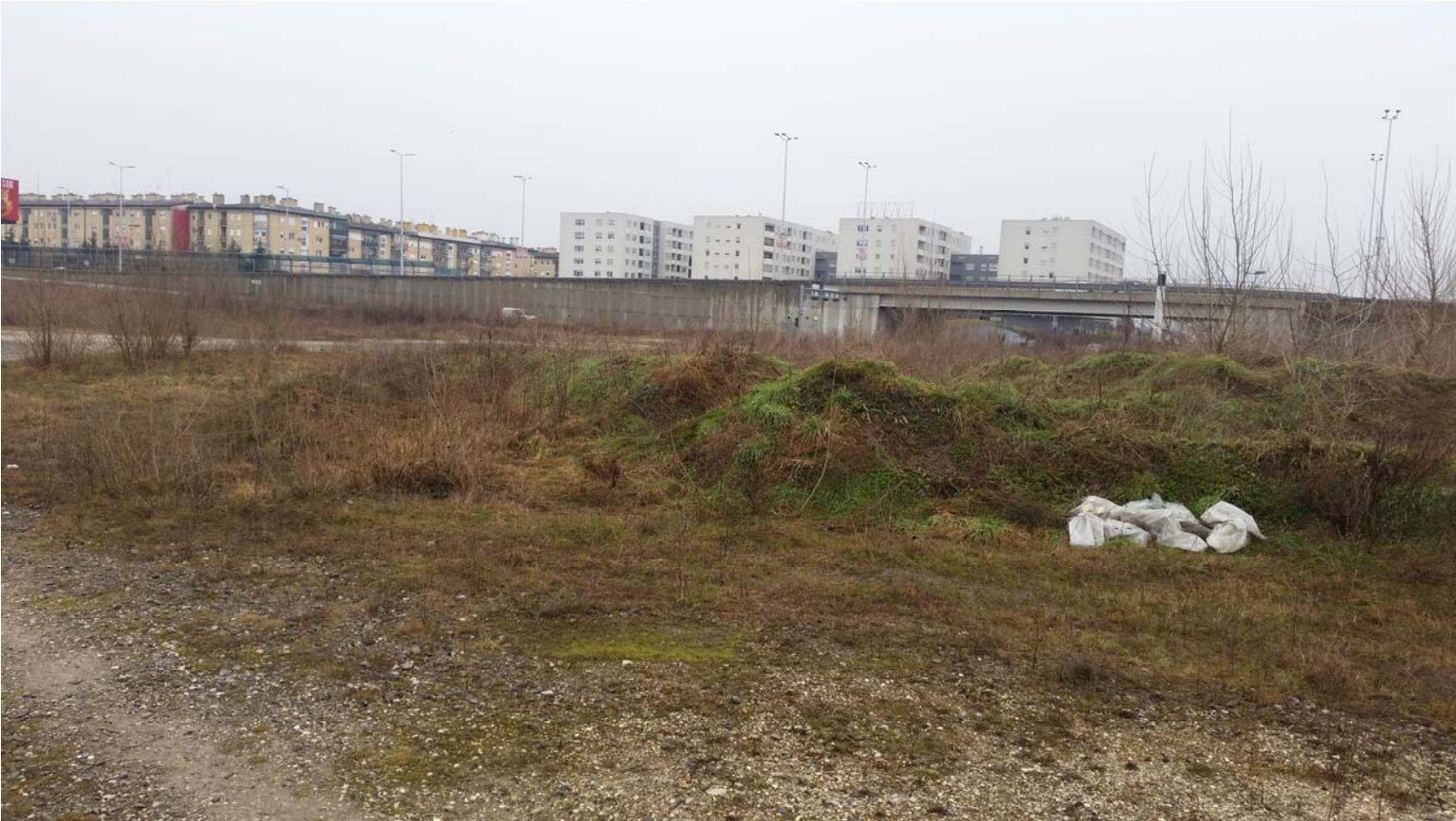
site 1- residential neighborhood in the background