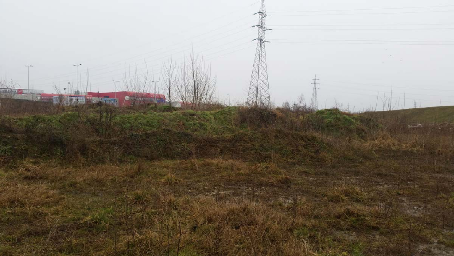
site 1- shopping centre in the background