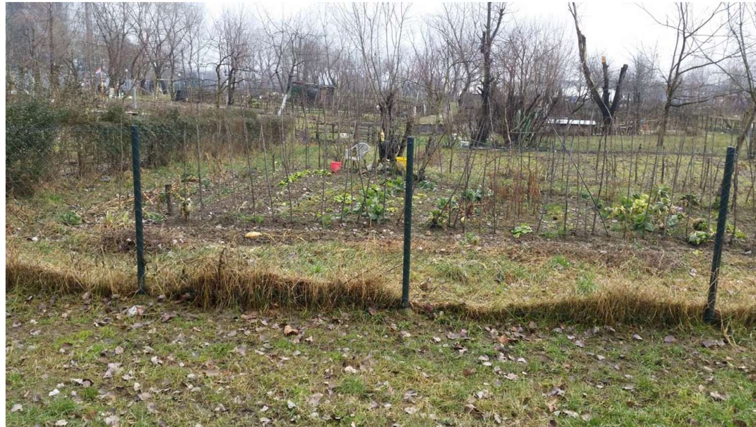
site 3 - community gardens