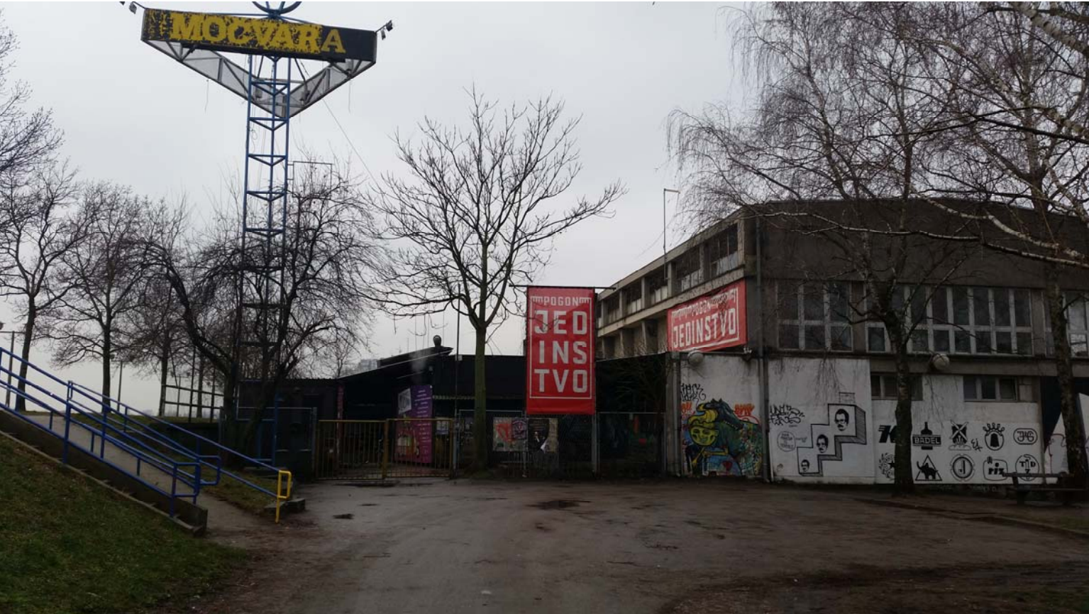
site 2- former industrial plant, turned into a centre of independent culture