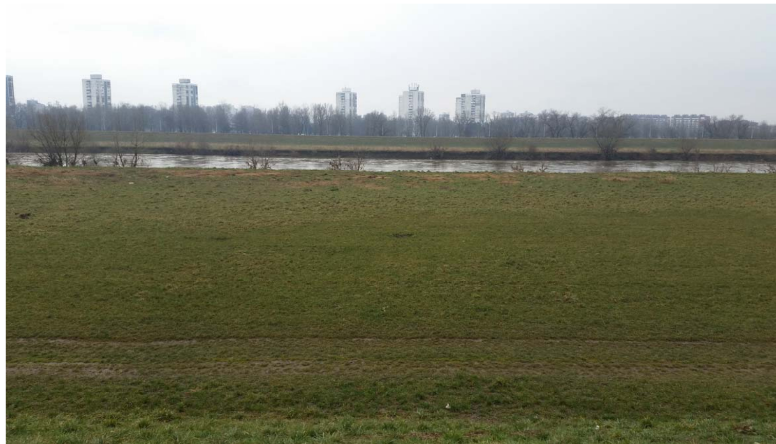
site 3 - view across Sava river towards the New Zagreb area