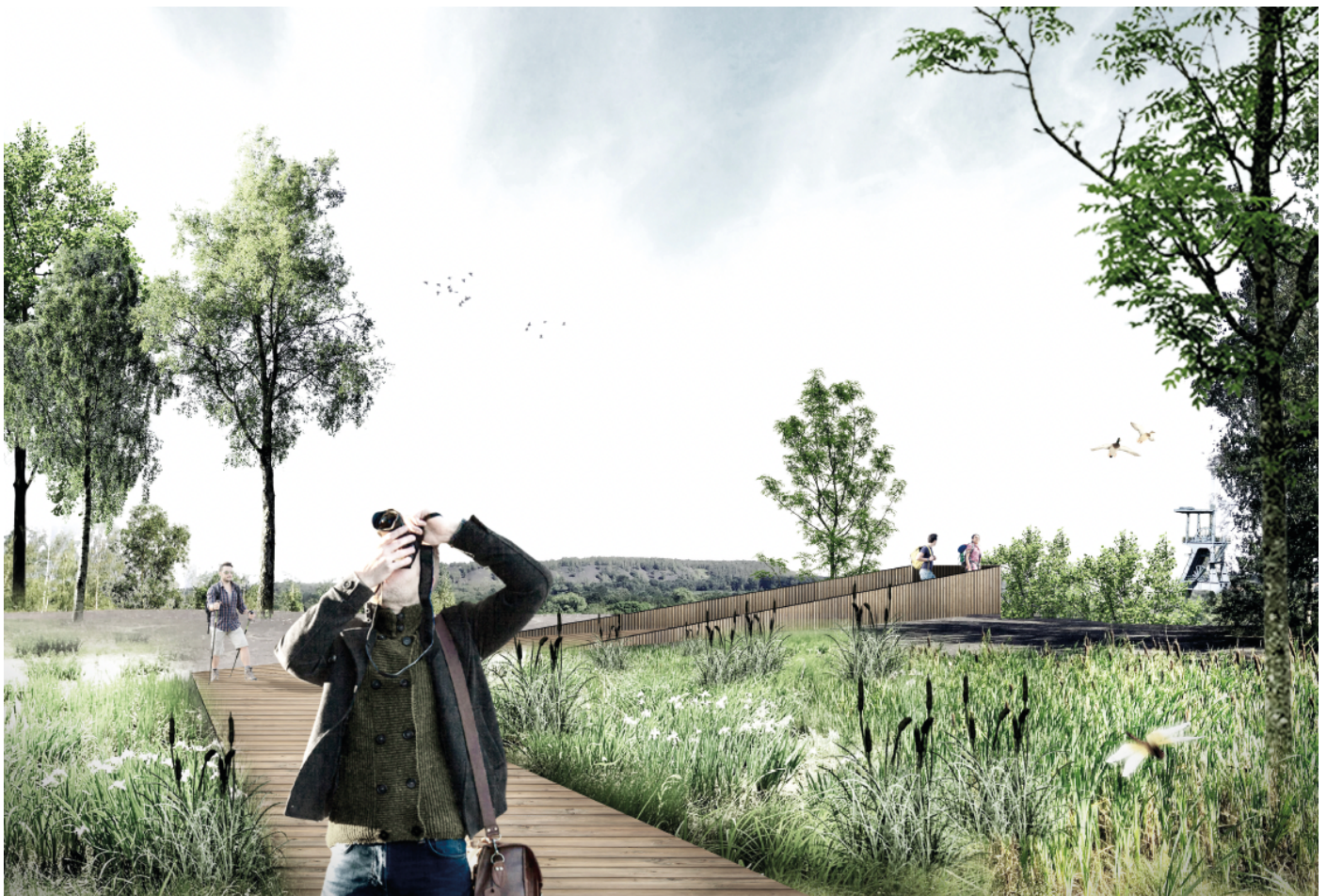
Figure 5 Lookout point on top of the slagheap. A floating path avoids impact on the unique plant species that live here.