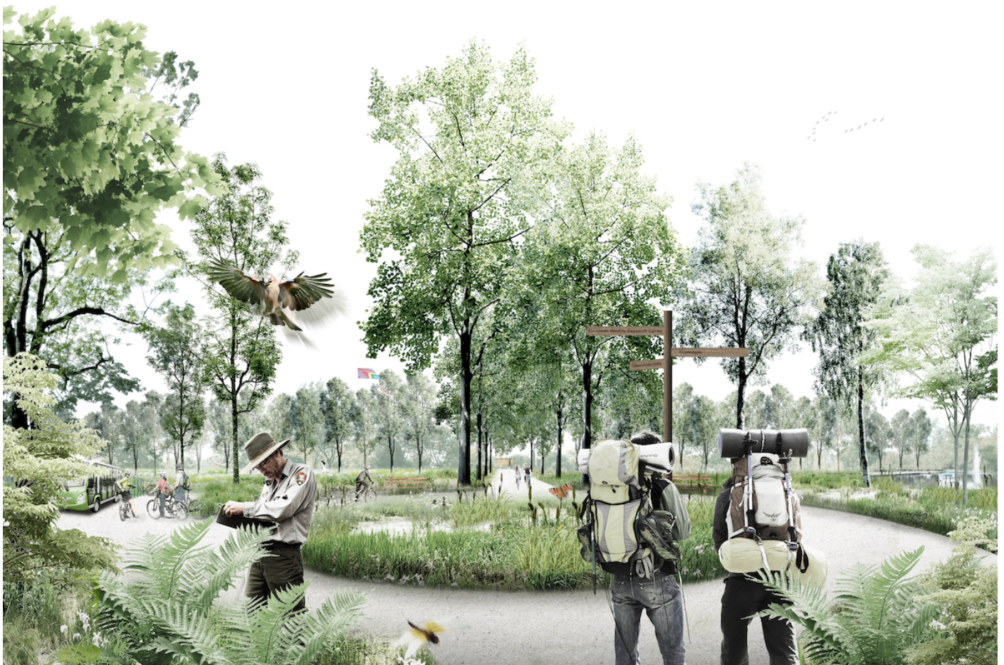
Figure 1 View on entrance zone Eco-hub Raismes

Biodiversity is being eroded by humans at a rate unprecedented in history. By the end of this century scientists expect the extinction of 20 to 50 percent of all living species on Earth. Important thinkers of our time fundamentally question the anthropocentric way of looking at and interacting with our planet. To ensure our own existence, we must move away from this binary view of human versus nature and develop an approach that is more sensitive towards other life forms. In order to tackle these ecological challenges we must radically redefine how our landscapes are organized in space and time. This means larger inaccessible zones where other life forms can flourish, and also clear gradations and templates for co-habitation in different areas. At the same time, there's a need for spaces where we can reconnect with nature and rediscover our own position in the natural world.