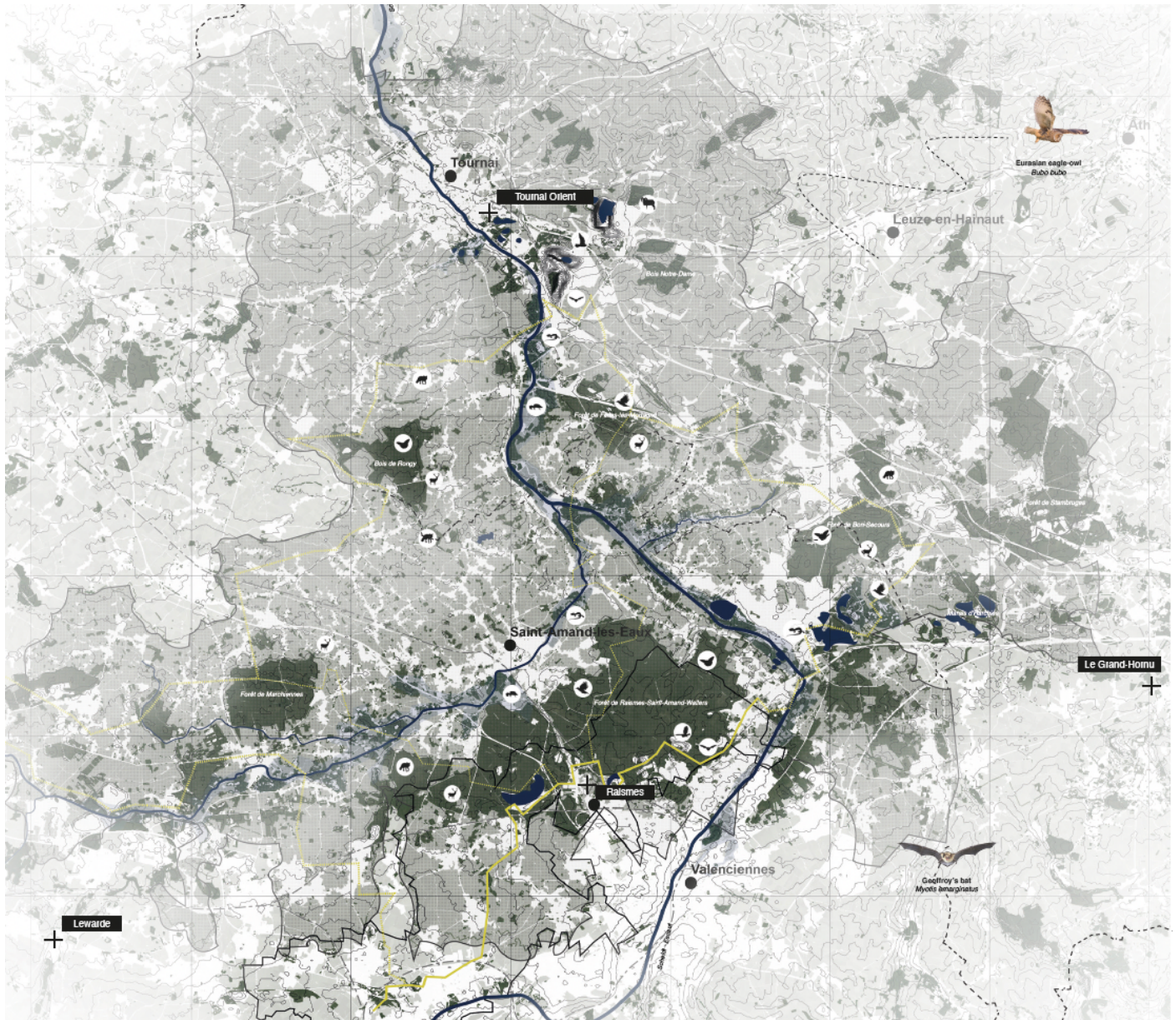
Figure 2 Overview European Wildlife Park Hainaut

The cross-border nature park Hainaut offers unique opportunities for further development as a large scale, European wildlife park. In order to provide answers to the loss of biodiversity, there is a need in Europe to establish larger contiguous nature areas where nature conservation and recreation can be developed in a more professional and large-scale manner (see also the ambitions of the European Green Deal and European Bauhaus). Thanks to the central crossing of the Scheldt river, the cross-border nature park Hainaut has an extensive ecological potential with many interesting wetland habitats, alternating with drier areas and artificial landscapes (e.g. Terrils) accomodating unique plant and animal species. With an area of 75,000 hectares, potential for expansion, and a unique mining heritage, this is an excellent location for the development of one of the most astonishing nature parks in Europe. In addition, the park is unique because of its proximity to large urbanized regions (Paris, Lille, Flanders, Brussels). This provides a unique potential to attract not only a broad public of tourists and recreational users, but also to forge important links with research institutes and universities in the region.