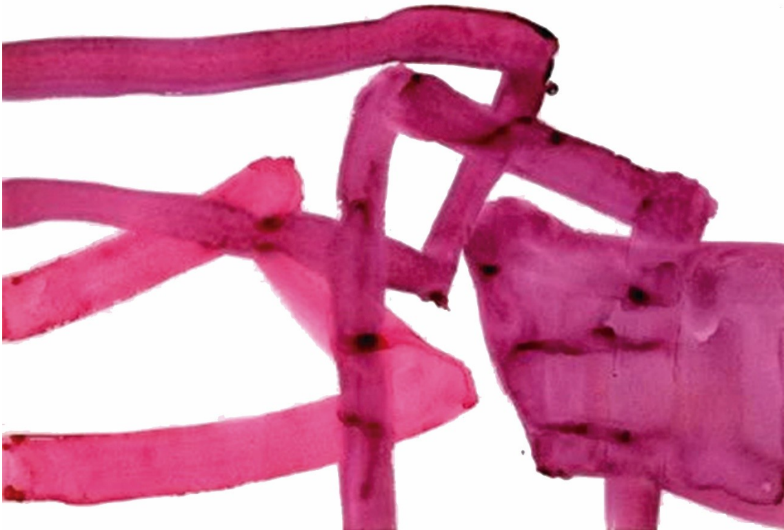
Author: Joel Shapiro_ Abstract Drawing

We seek a mixed, inclusive, collaborative landscape project that generates proximity mobility and fosters mixed synergies among the different activities of the environment/indigenous and those received from abroad. For this, we opted for strategically mixing living spaces and the equipments, with free space.