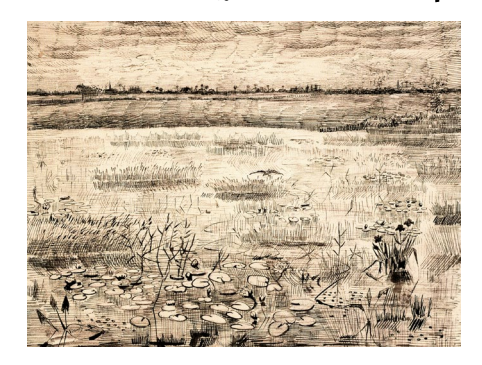
V. Van Gogh "Marsh with water lilies", 1881

This painting, executed in North Brabant in 1881 shows a typical Dutch waterscape with a human settlement on the background, where nature and the anthropic interventions seems to coexist peacefully without interfering with each other.