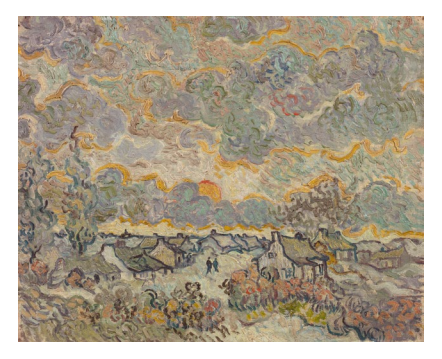
V. Van Gogh "Reminiscence of Brabant", 1890

During a difficult period, Van Gogh painted scenes of his native region. A region where the urban environment was integrated with the context, where the productive was starting to be industrial but also was still "cottages with mossy roofs and beech hedges on an autumn evening with a stormy sky, the sun setting red in reddish clouds.