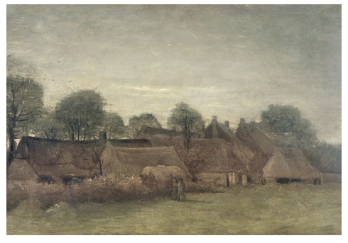
V. Van Gogh "Rural village at night", 1881

The thatched peasant's houses in Nuenen and the surrounding area reminded Van Gogh of its origins, making him think of the Brabant of its youth. A Brabant where the human environment was in symbiosis with the non-human one, highlighting how this is a heritage and landscape deeply rooted in his country's history, which is just as important as the industrial one.