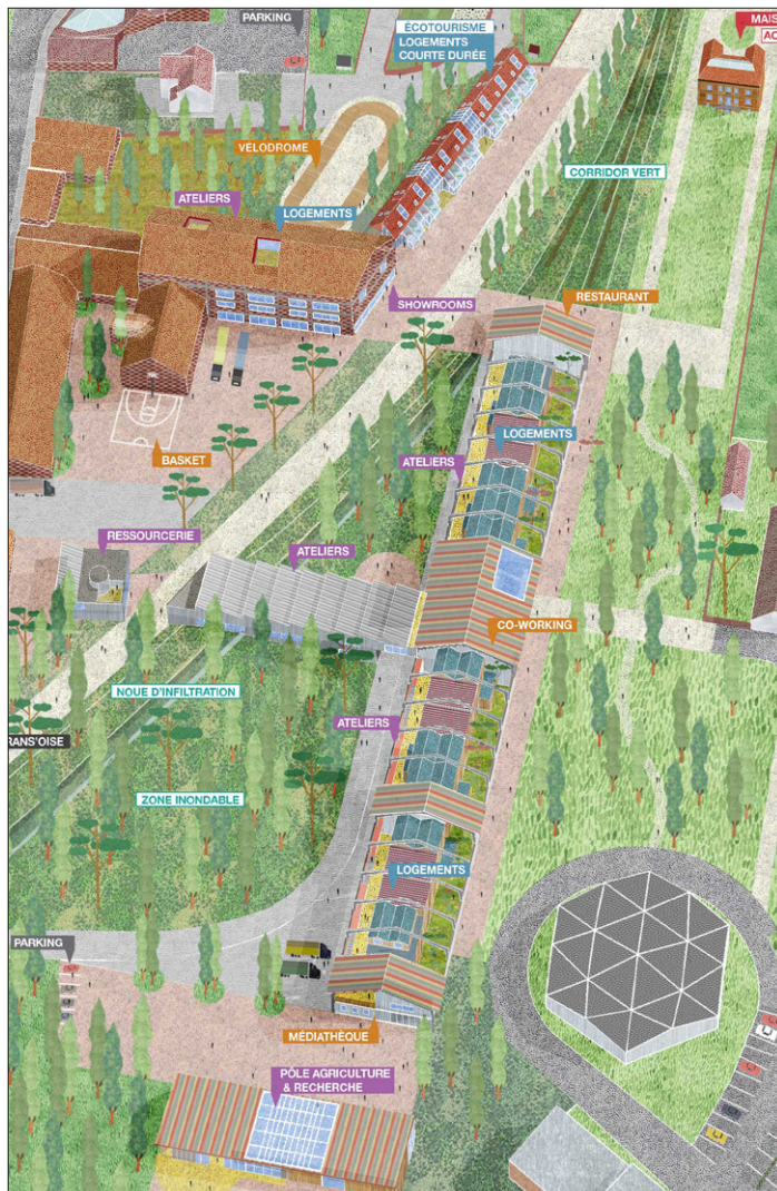
Zone Sud du territoire