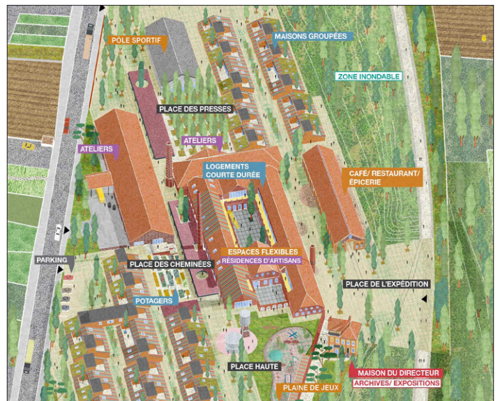
Zone Nord du territoire

running track...) as a support to the Trans'Oise. As for the sports areas, they can also have a double function, marking the green corridor zone that is the Trans'Oise, with a high ecological value, which, during important rainy events, can become storm water basins, places where runoff water coming from the upper part of the territory is collected. Thus, the notion of temporality makes the site always active, at different times, the inhabitant, the worker, the visitor and the seasons make the site continuously active.