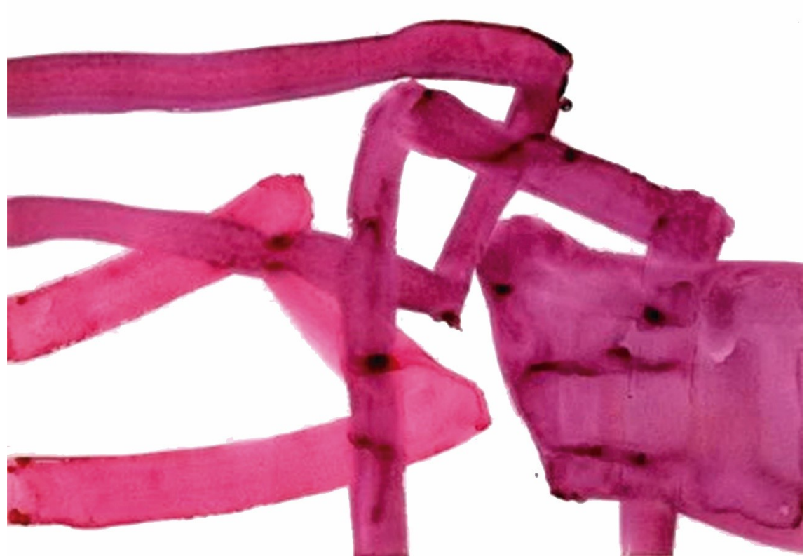
Author: Joel Shapiro_ Abstract Drawing

We seek a mixed, inclusive, collaborative landscape project that generates proximity mobility and fosters mixed synergies among the different activities of the environment/indigenous and those received from abroad. For this, we opted for strategically mixing living spaces and the equipments, with free space.