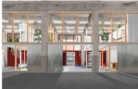
Street view of the ground floor of the existing building

diverse needs. In summary, our vision for the public space in this project is centred around fostering a sense of community, providing opportunities for social interactions, and enriching the lives of Eibar's residents through thoughtful design and inclusivity.