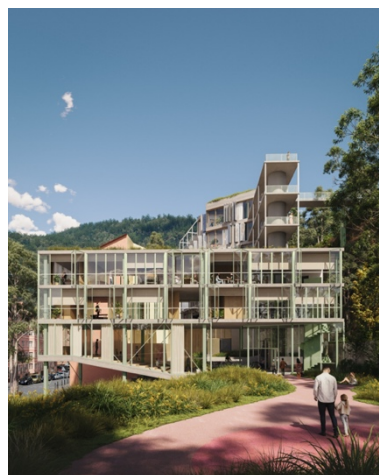
View from the garden of the new building

Furthermore, we propose a new public equipment that houses a school of crafts, paying homage to Eibar's rich tradition in metallurgy and craftwork. This decision not only preserves and celebrates the city's existing knowledge but also creates new opportunities for the younger generation by making these skills accessible and fostering potential employment prospects. Integrating the educational facilities within our proposal not only adds value to the community but also offers the possibility for people interested in studying there, the convenience of living in proximity to their learning and daily activities. The building acts as a public infrastructure, as apart from its educational use, it hosts a cafeteria and an open space on the ground floor, and an amphitheatre on the first floor, accessible to the public.