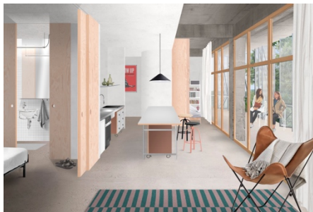
Interior view of a two bedroom apartment

The design emphasizes the importance of community and the various ways residents can interact and collaborate within the living environment. By offering flexible and adaptable spaces, the proposal aims to cater to the diverse needs and lifestyles of the inhabitants, creating a harmonious and welcoming living experience for all.