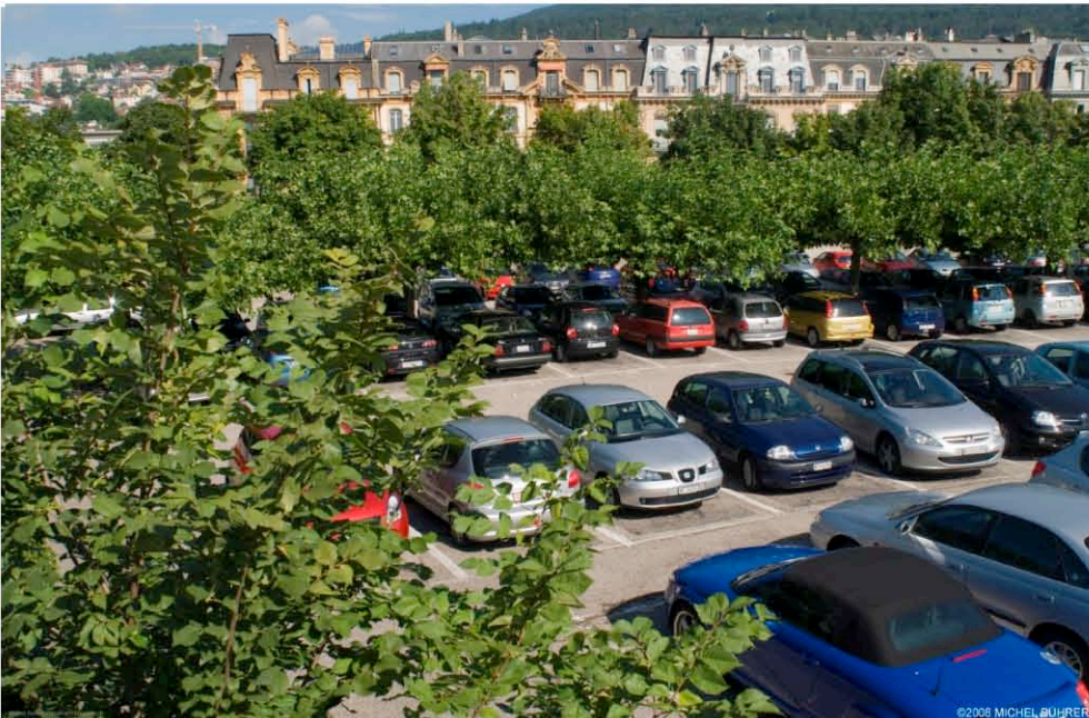
Car park in the project site – land use must be redefined