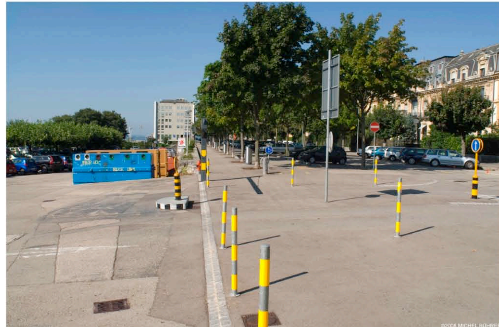
Limits of the project site with the "Jeunes-Rives" housing district