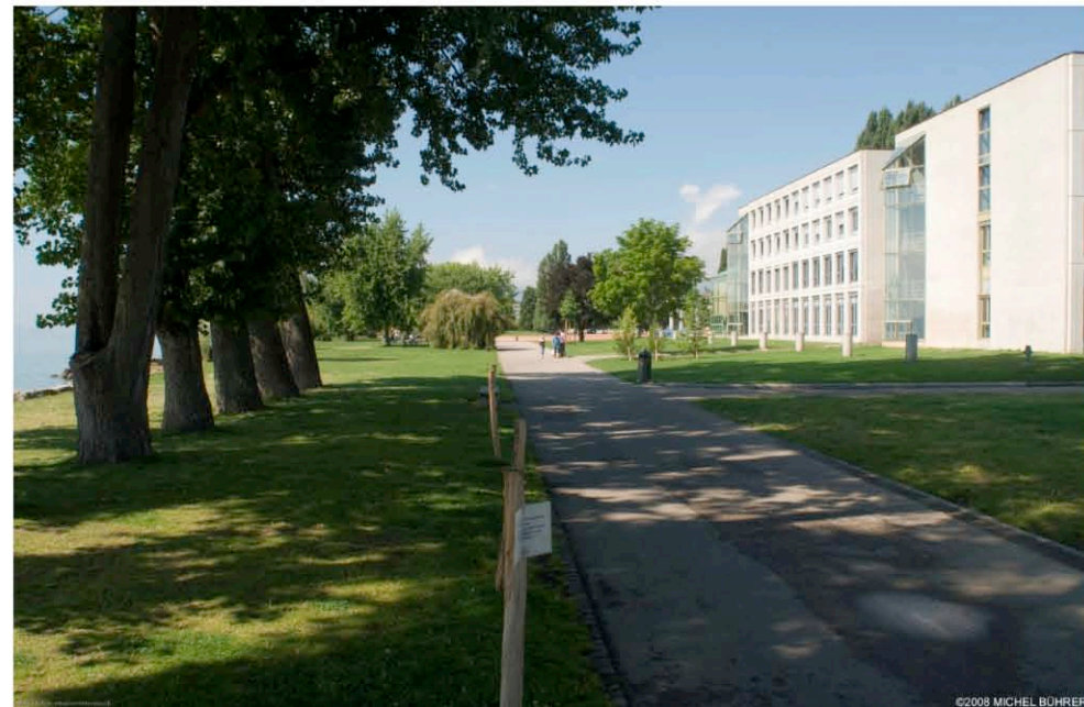
Pedestrian promenade along the project site with the lake to the left