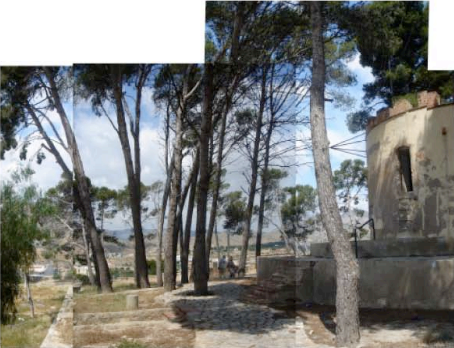
High place of San Miguel, antique water tank.