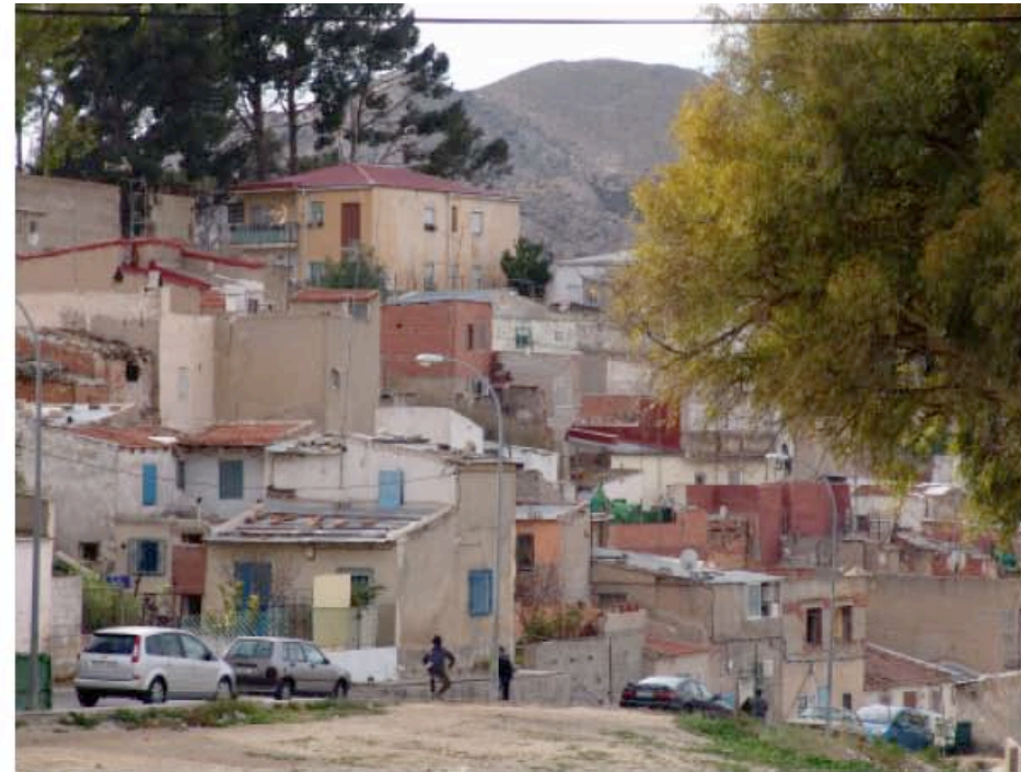
Tafalara's neighbourhood, project area.