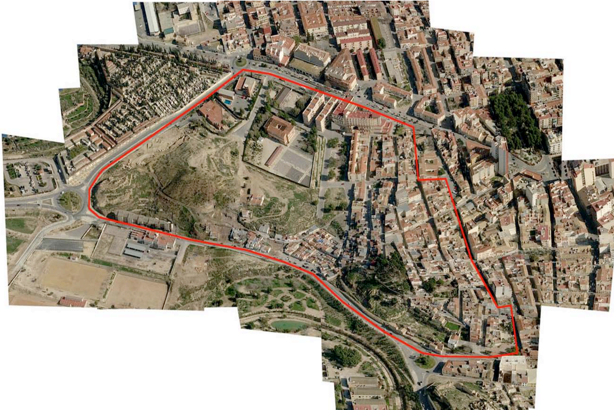
Aerial photo perspective