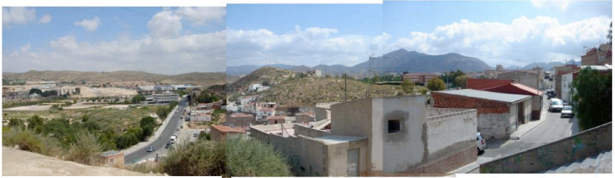
Tafalara's view from the high place of San Miguel