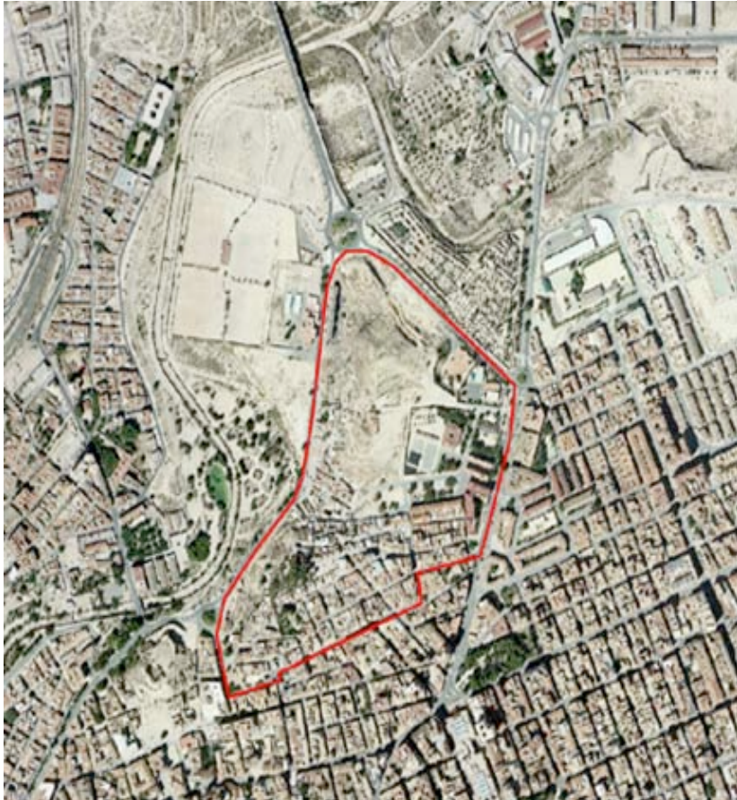
Aerial photo of the site in its territorial context