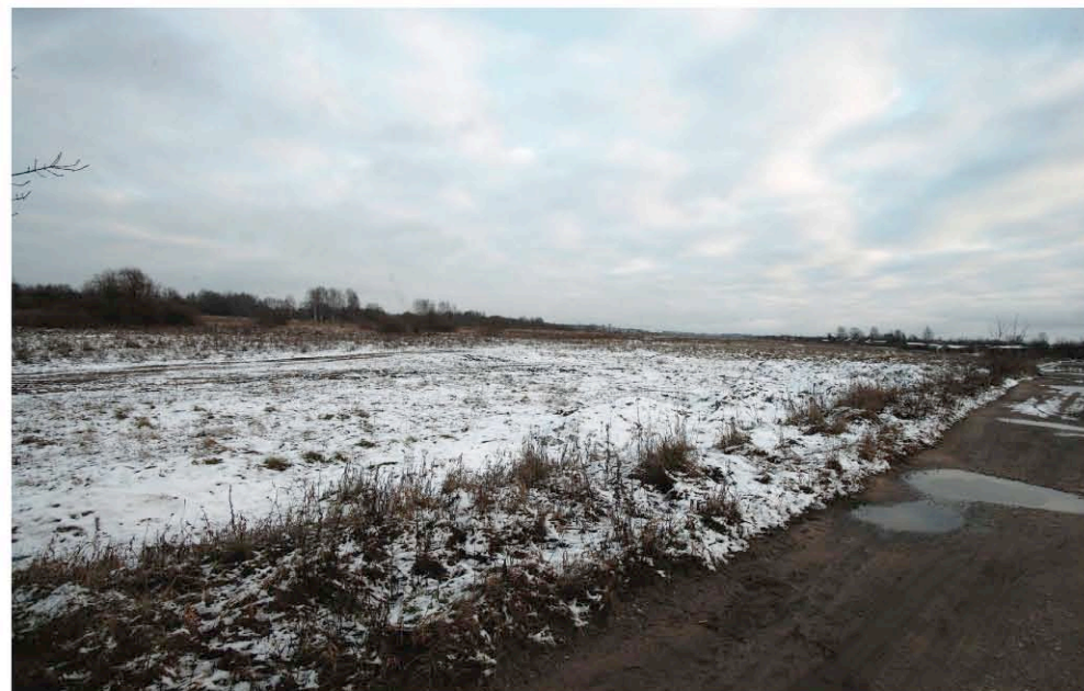
A - View from the site over the river Daugava to the opposed embankment C - Aerial view of the site