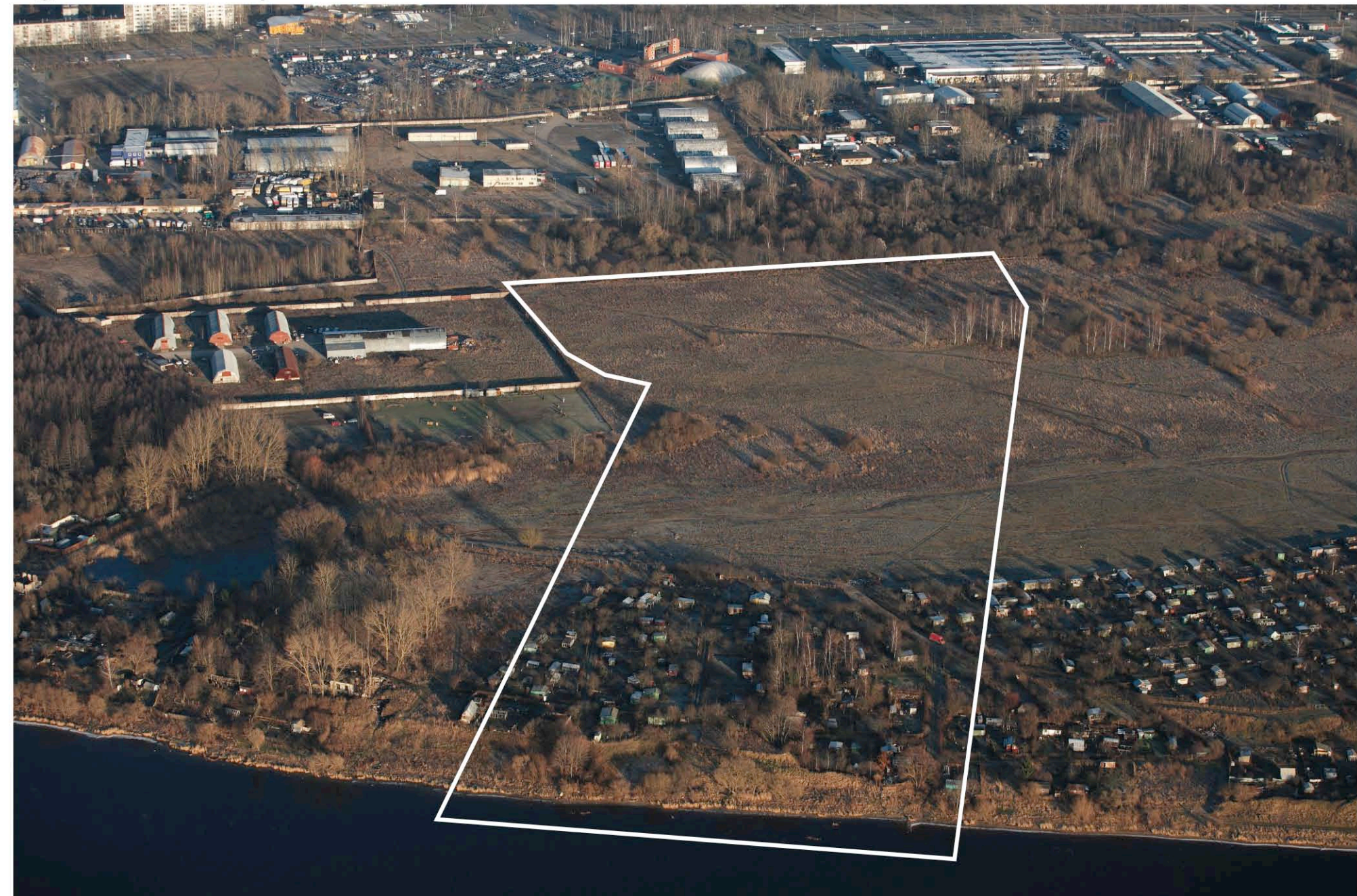
A - Aerial view on the site