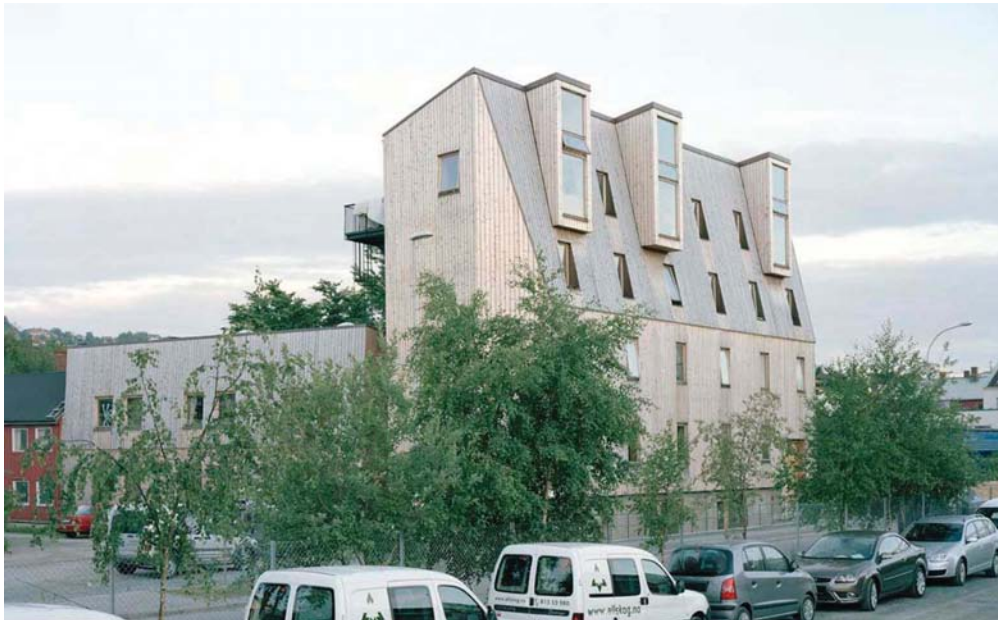
Building by Brendeland & Kristoffersen in study area.