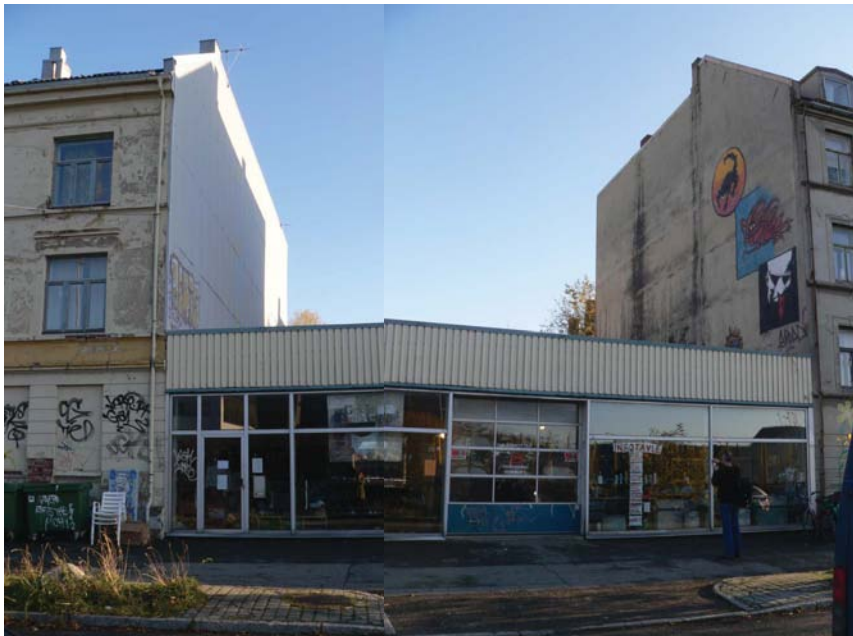
The building site seen from north west.