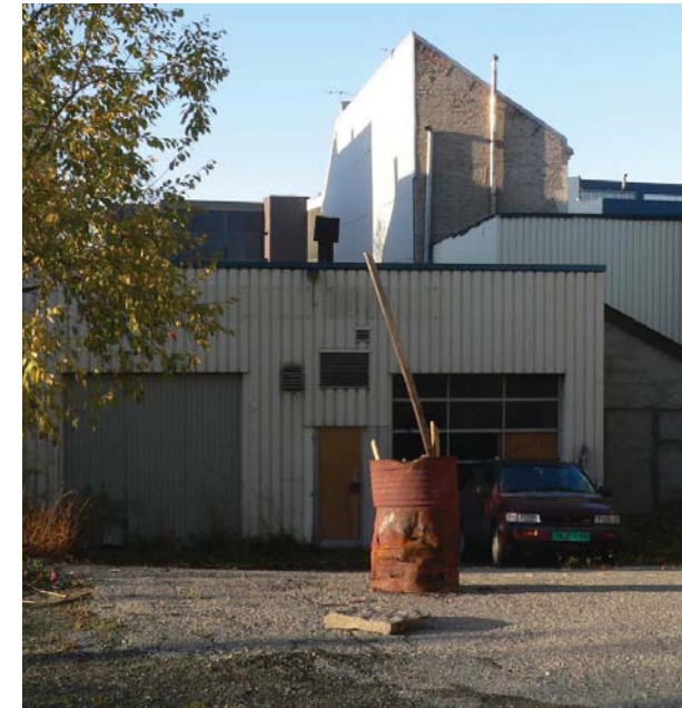
The building site seen from south east