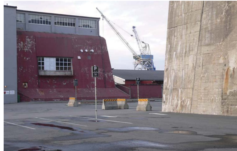
The Dora complex, part of the study area.