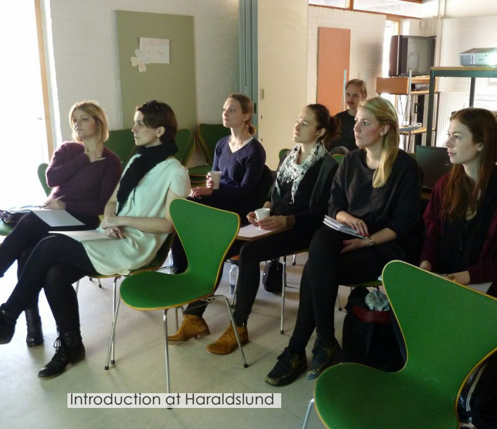
Introduction at Haraldslund