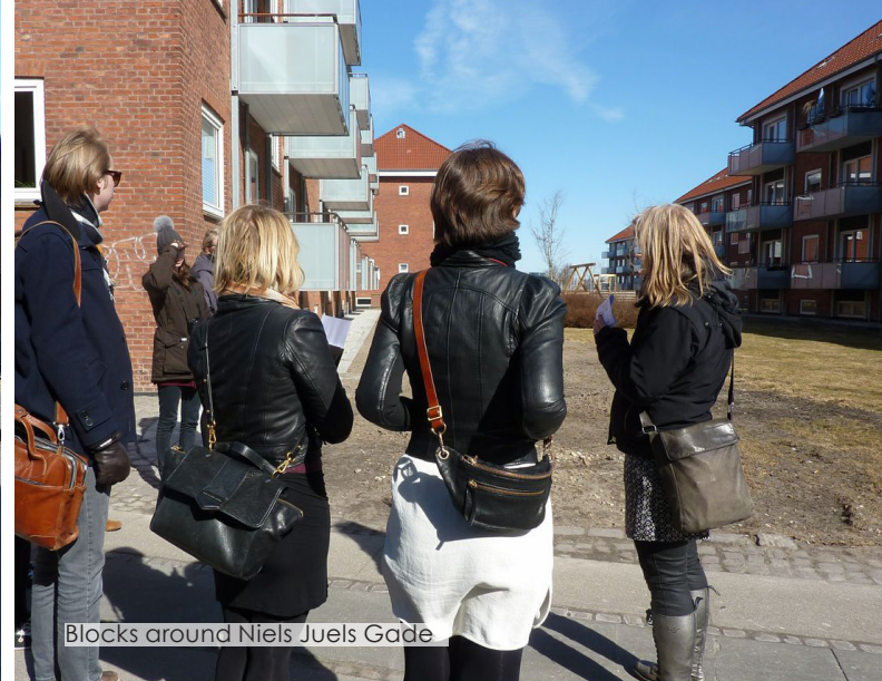
Blocks around Niels Juels Gade