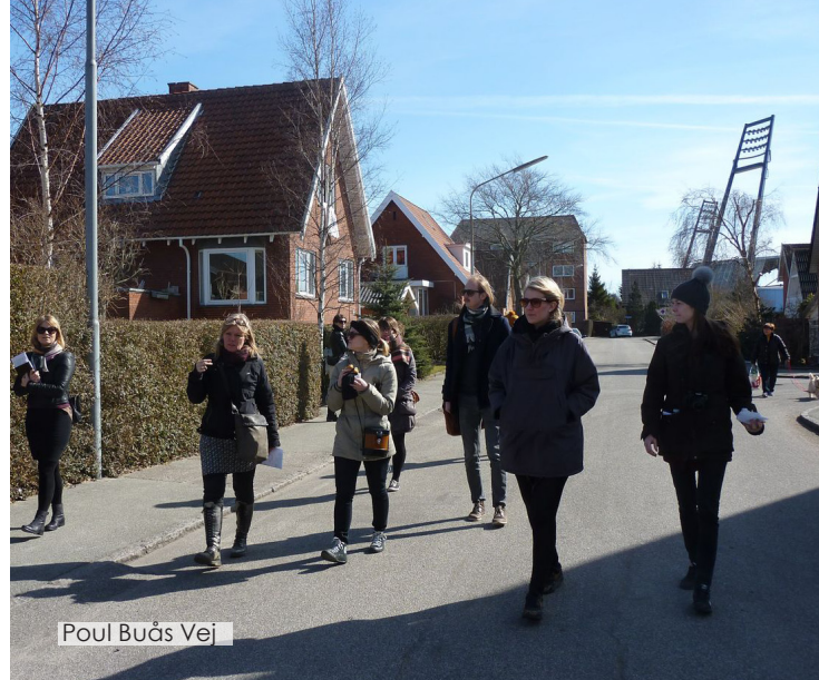
Poul Buås Vej