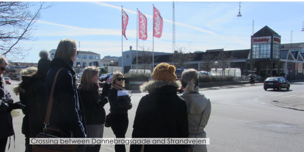
Crossing between Dannebrogsgade and Strandvejen