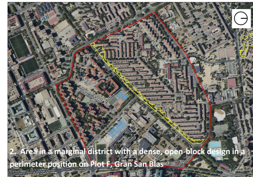
2. Area in a marginal district with a dense, open-block design in a perimeter position on Plot F, Gran San Blas