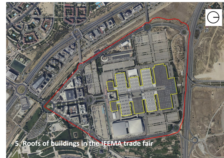
5. Roofs of buildings in the IFEMA trade fair