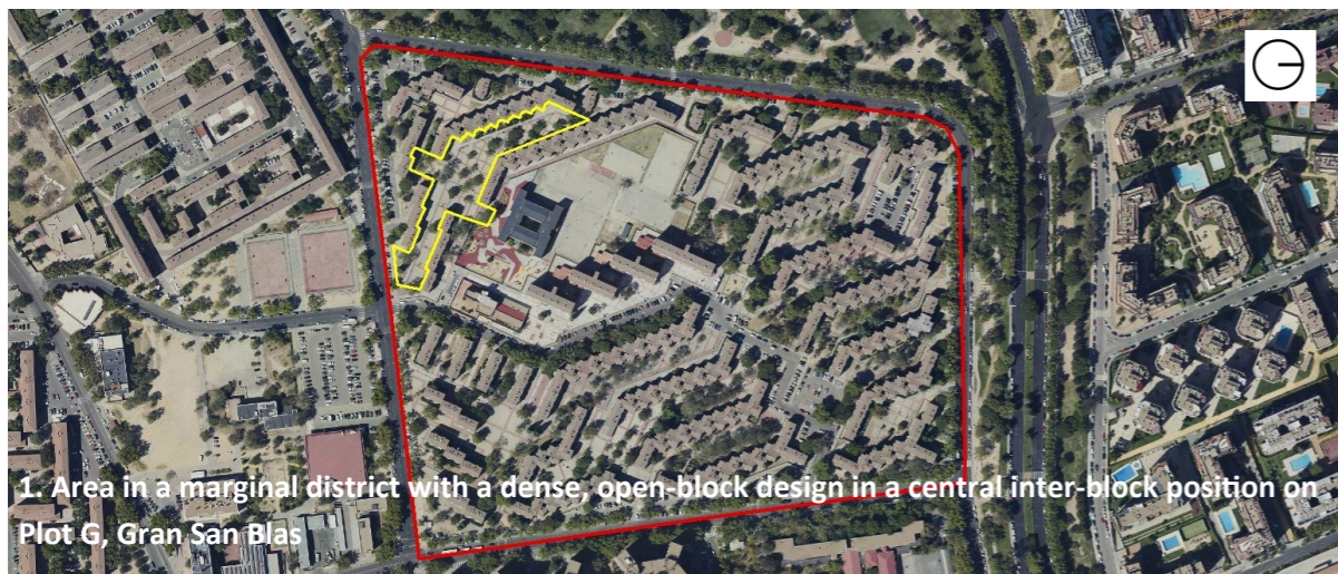
1. Area in a marginal district with a dense, open-block design in a central inter-block position on Plot G, Gran San Blas