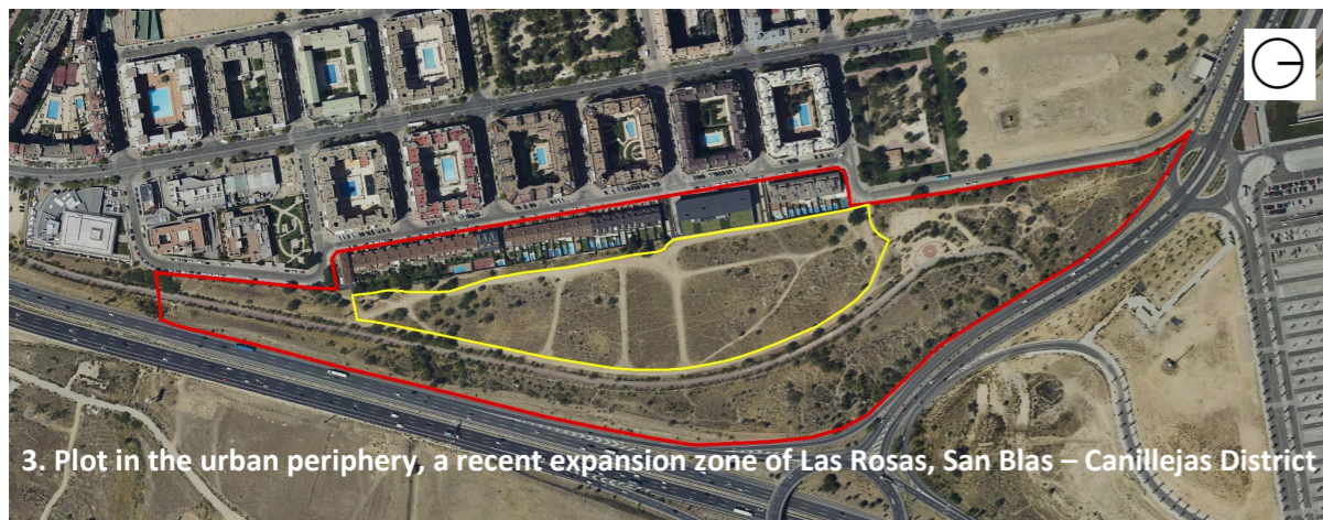
3. Plot in the urban periphery, a recent expansion zone of Las Rosas, San Blas – Canillejas District