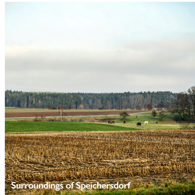
Surroundings of Speichersdorf