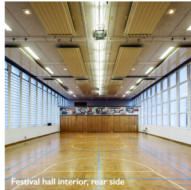
Festival hall interior, rear side