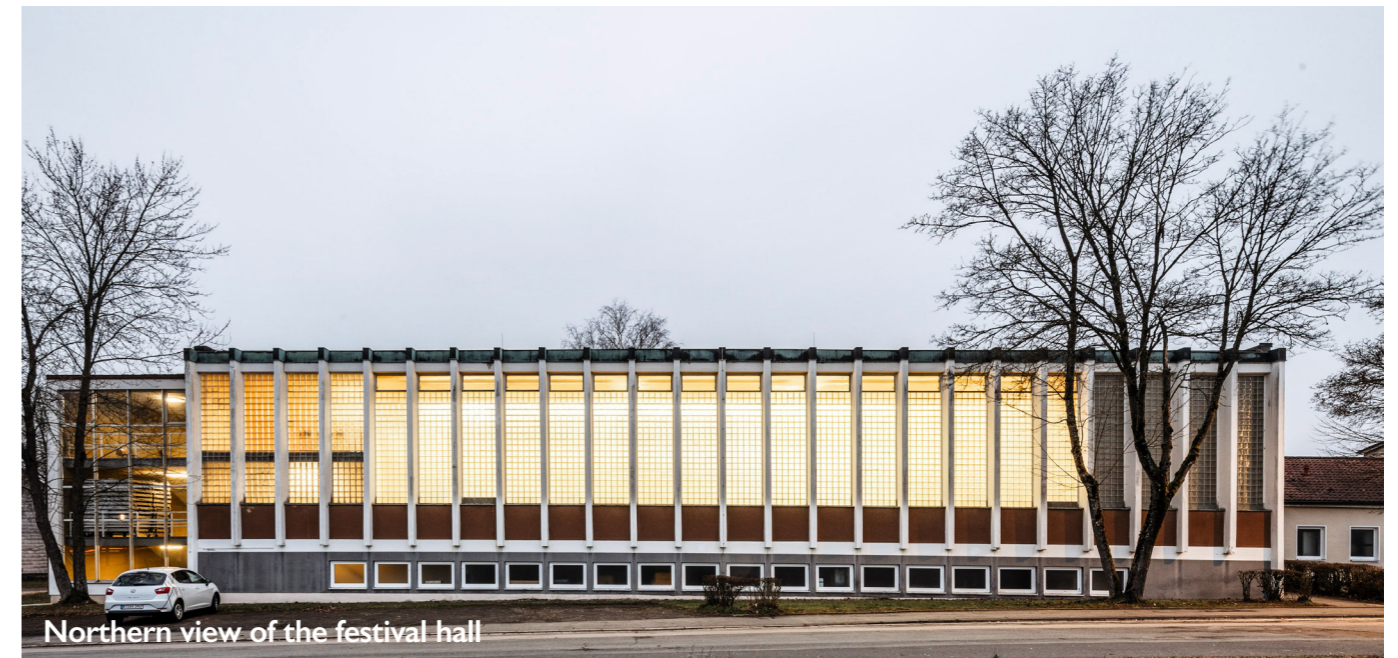
Northern view of the festival hall