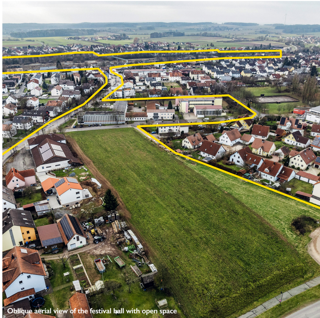
Oblique aerial view of the festival hall with open space

How can the former festival hall be revitalised and further developed with low-cost structural interventions?