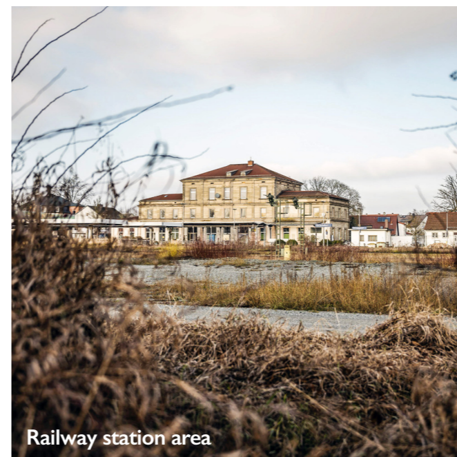
Railway station area