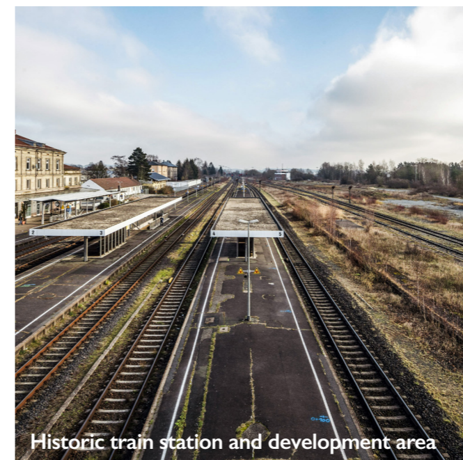
Historic train station and development area

Open areas as a space resource: What role can the open areas inside the municipality play in the future? What contribution can they make to topics such as climate adaptation, biodiversity, and local food supply? What area potentials can be shown for housing development?