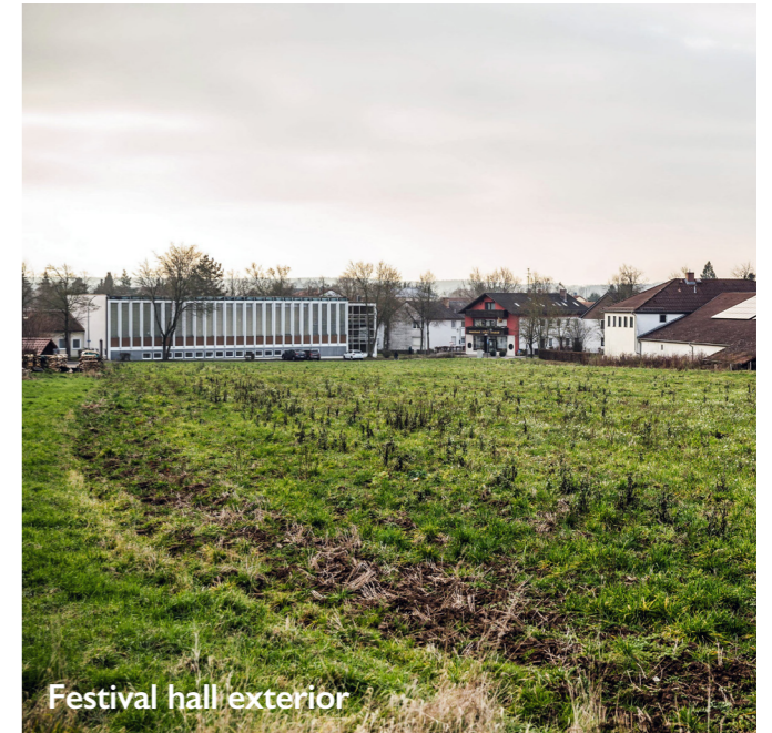
Festival hall exterior

How can the former festival hall be revitalised and further developed with low-cost structural interventions?